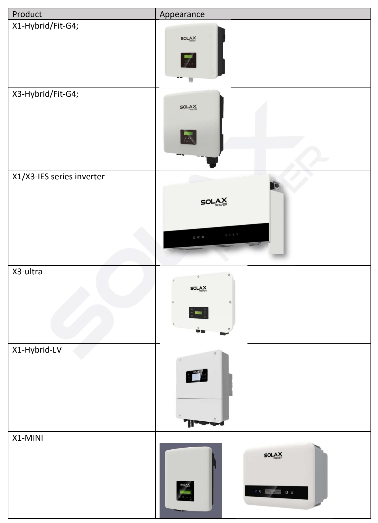
Table 3: Product and Appearance